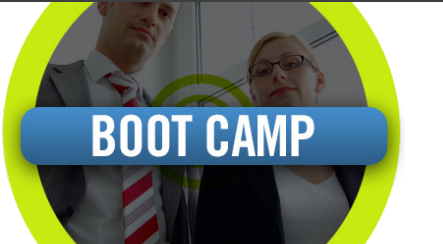
DAY ONE Business Engagement Boot Camp™