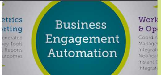
DAY TWO CRM Training