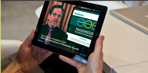
FREE TABLET Mobile Use

Professional Development Training: B2B Marketing, Consultative Selling & Data Analysis for Business Engagement